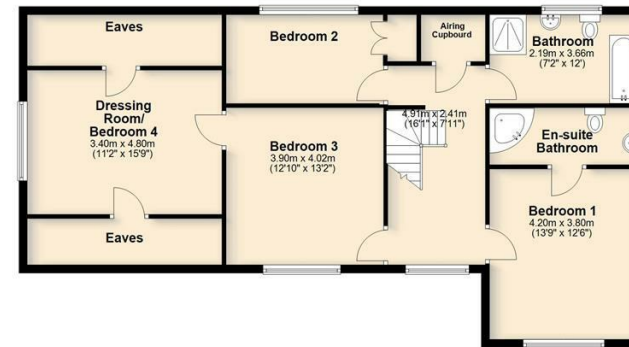
Total area: approx. 204.2 sq. metres (2198.1 sq. feet)